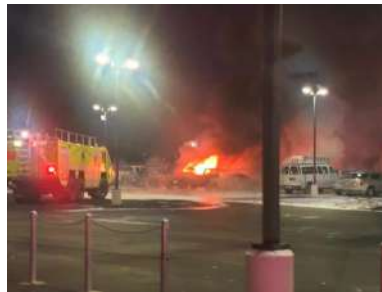
Click on the photo above for video