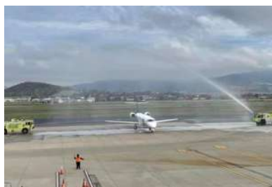
Click photo for video.