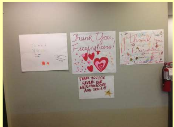
Thank You Notes