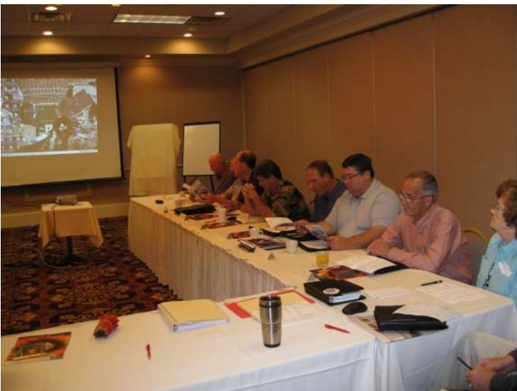
2009 Chiefs Meeting– Green Bay